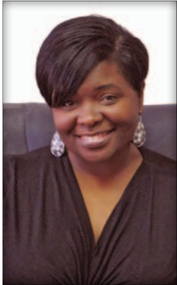
Top 50 Business Leaders of the Triangle —Triangle Business Leader Magazine, 2012